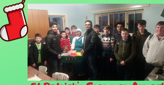
St Patrick's Grammar, Armagh