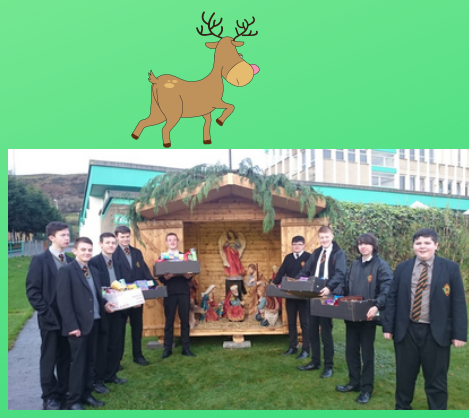
St Mary's CBGS, Belfast