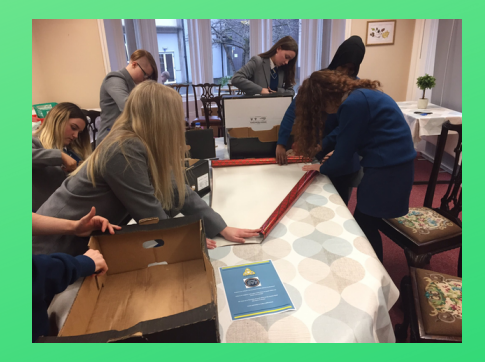
Blessed Trinity College, Belfast